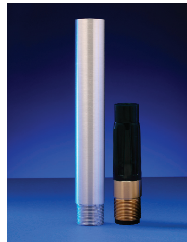
SN159-6XL vs. TLVE-6P

Microstructure of BP200 Elongated grains provide increased toughness over competitive lightweight ceramic nozzles